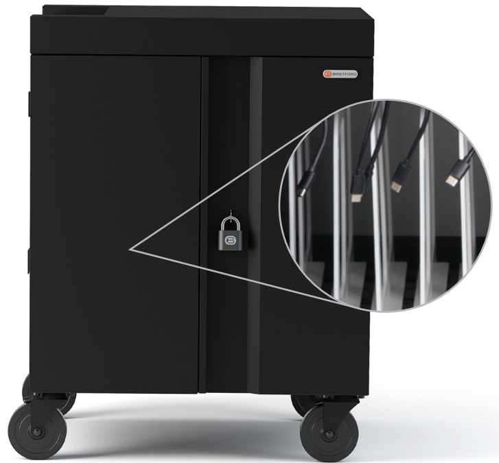
CUBE Cart ® Pre-Wired shown in Black Pumice (BP)